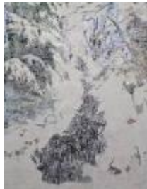
Ji Yoon Ryu Difficult Memory #3 Mixed media on canvas 150 x 120 cm 2010

For further details about Generation 10 , contact Candlestar: