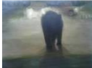
Michael O'Reilly Stasis Oil on canvas 200 x 170 cm 2010