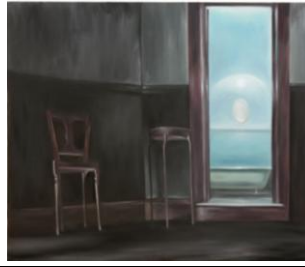
Chris Golle Hotel Room Oil on canvas 160 x 225 cm 2010