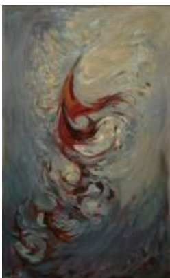
Mansoureh Hosseini, Refuge to Light , 1996