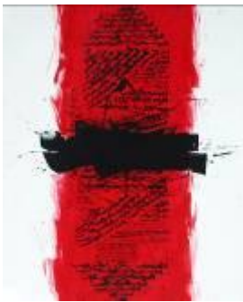
Golnaz Fathi, Untitled , 2008