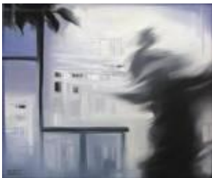
Tahereh Samadi Tari, Restless , 2008