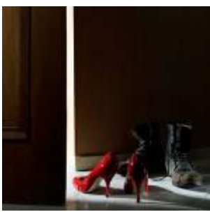
Shadi Ghadirian, Nil, Nil , 2008